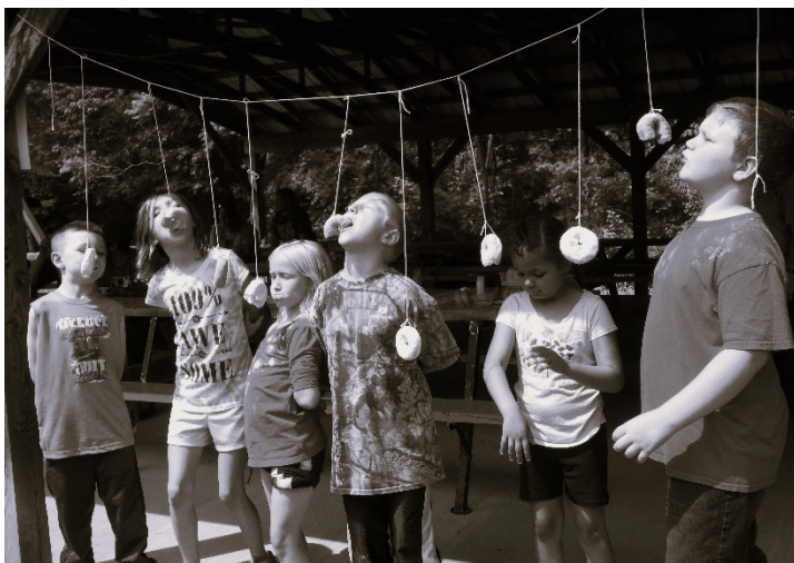
Kids games at Marsh Hill 2017

Pennsylvania Longbow Association Newsletter 64 Vanman Lane Lehigh, PA 18235-3419