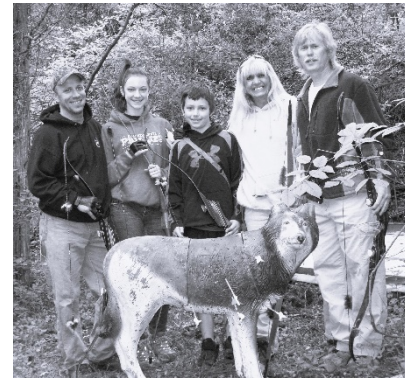
Standing Stone 2012