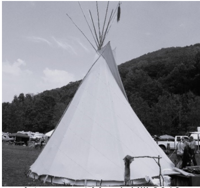
A teepee at Marsh Hill 2010

The field was open in the middle and kids would play football or frisbee in the evening. The Buckskinners would get kegs of birch beer and set out in the field for folks to go to. Oh, and the community campfires. There was so much food being passed around: sausage, caribou stew, deer steaks, donuts and frybread... Oh my God, you would walk away totally stuffed. Oh, and people had jugs of Bug Juice too.